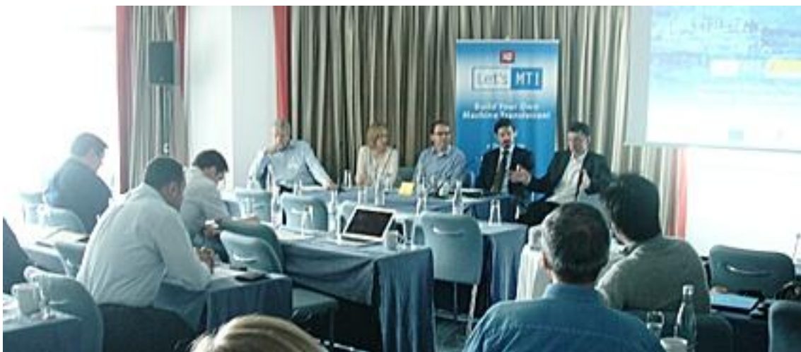
Figure 1: GALA2012 LetsMT! workshop panel discussion